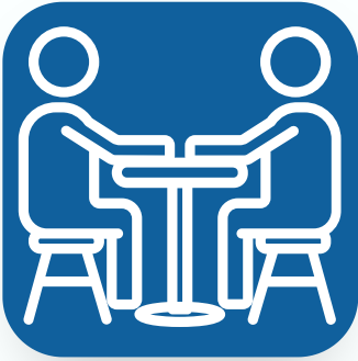
In person F2F