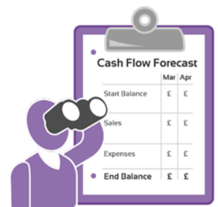
Cash Flow Forecast